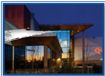
Northern Quest Resort & Casino

Thursday or Friday Meal (Check specific day on the Registration Form)